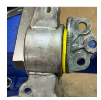
Push bracket/post back into place