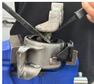
Secure mount in vice and pry central post out of Figure 1: