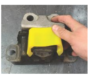
Figure 4: Push insert into place