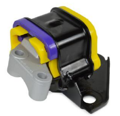
Figure 1 - showing all polyurethane inserts fitted inside the engine mount