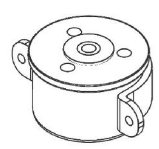
Figure 2 - assembled gearbox mount bush in the bracket

POWERFLEX +44 (0) 1895 460033 sales@powerflex.co.uk www.powerflex.co.uk