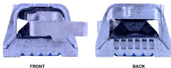
Figure 3 - profile of the Upper engine mount that uses this insert.

PFF85-832 FITS UPPER ENGINE MOUNT WITH THIS PROFILE ONLY