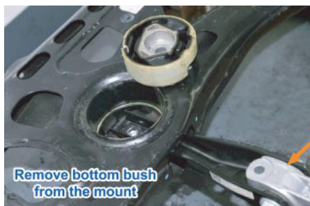
Engine mount connecting rod.