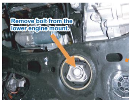
Bottom view of the front subframe