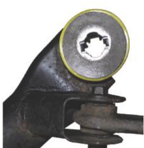
Figure 2 - diagram showing how polyurethane part B