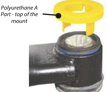
Figure 1 - diagram showing how polyurethane part A fits