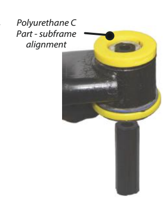
Figure 3 - diagram showing how polyurethane part C fits