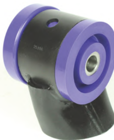
Figure 2 - Bush Fitted