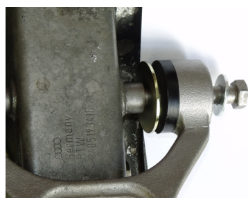
Figure 1- Fitted Image