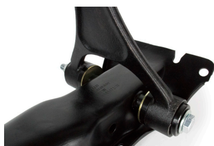
Figure 1 - Fitted Image