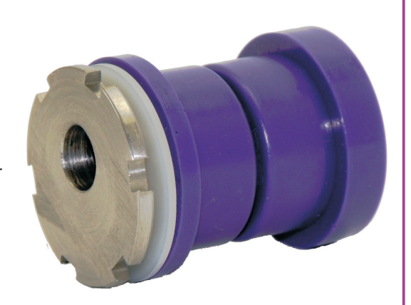
Fig 2. Assembled view.